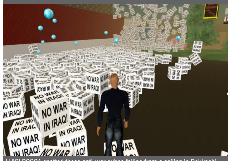
LUIGI ROSCA spotted these anti-war cubes falling from a ceiling in Dokkaebi last week, and told The AvaStar they took more than 18 hours to clean up.